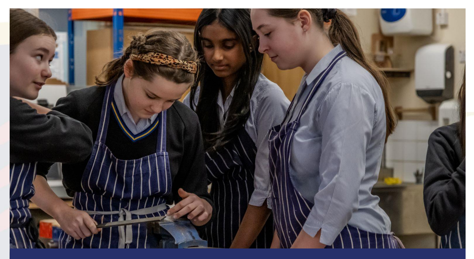
"My daughter loves her new school, she has settled very well because of friendly and helpful staff at school."